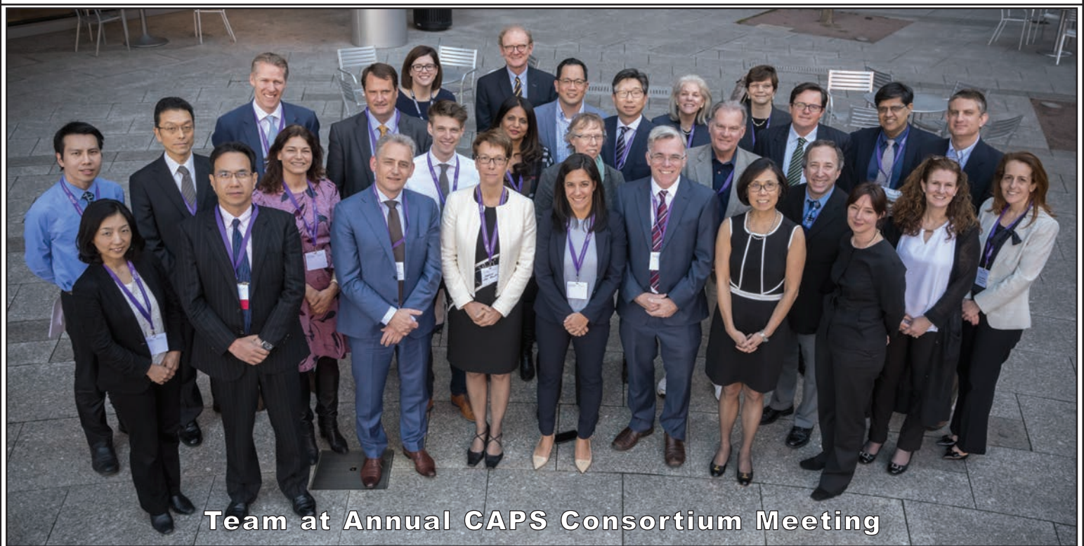
Team at Annual CAPS Consortium Meeting